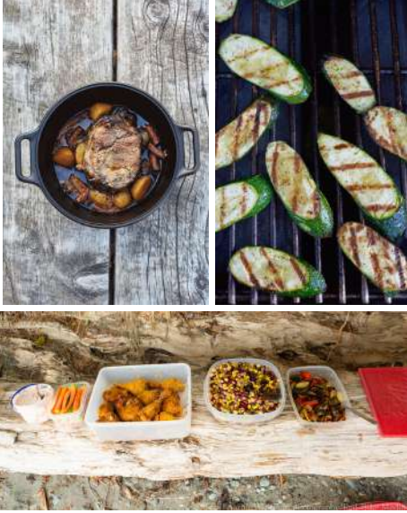
Note: Not exact meals pictured

We have a float camp cook who stays at the lodge for a few weeks at a time, hosting and cooking for the trips.